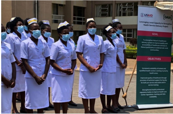
HRH Nursing Scholars at the Kamuzu University of Health Sciences Inauguration Ceremony.